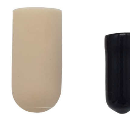
Storing caps: beige for sleeve for liquids, black for penetration sleeve

We pay your attention to the favourable price, much lower than the price of electrodes for similar purposes offered by their companies.